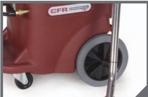
Large 12" stair climbing wheels.