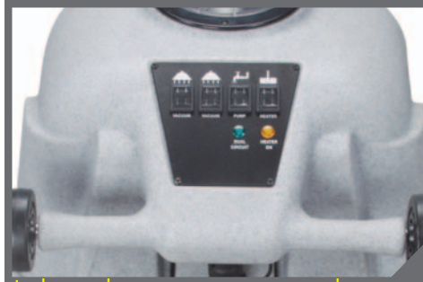
Independent motors, pump and heater switches.