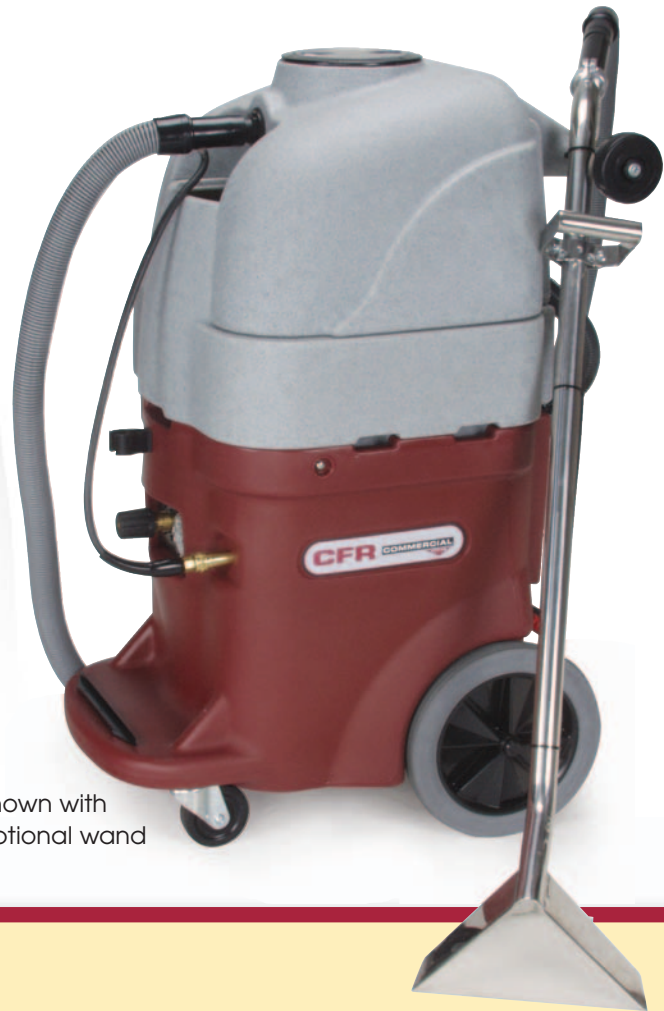
Shown with optional wand

CFR Upright Extractor, maximum cleaning power for professional applications!