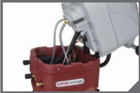
Easy access to internal components.