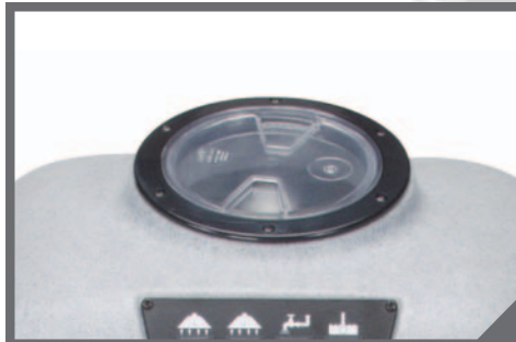
Large solution and recovery tank openings for easy tank cleanup and filling.